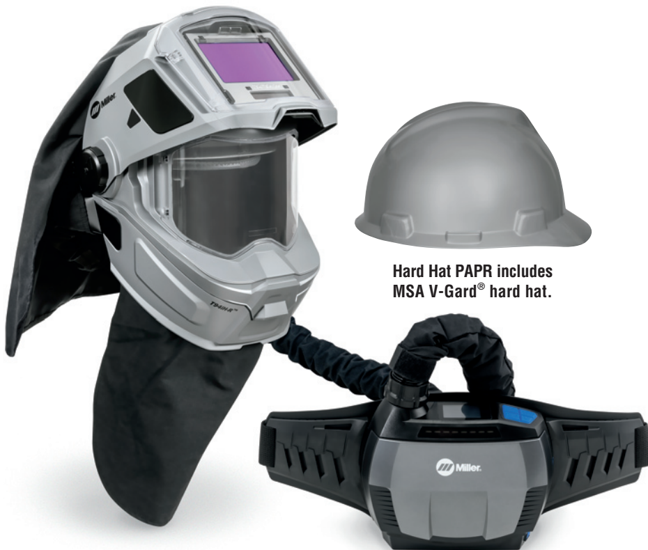
Hard Hat PAPR includes MSA V-Gard® hard hat.