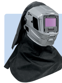
Optional heavy-duty head seal provides additional protection with an APF of 1,000.